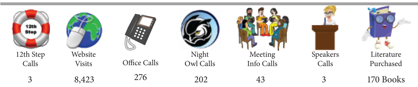
THE FOLLOWING GROUPS, MEMBERS AND FAITHFUL FIVER MEMBERS MADE THE ABOVE SERVICES POSSIBLE: