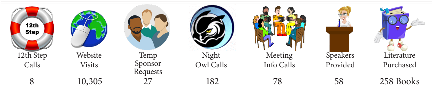
THE FOLLOWING GROUPS AND FAITHFUL FIVER MEMBERS MADE THE ABOVE SERVICES POSSIBLE:

It's important to come prepared by having studied the Conference Advisory Actions for your committee with some thoughts to bring to the group conscience. These are the directives by 2/3 or more of the fellowship's conscience as voted on at the GSC. Predominantly, its new business being handed to the Board ("The Arm of the Conference") to accomplish before the next annual conference. By my third year (and first as committee chair) I more proactively got going on items after the GSC but before the