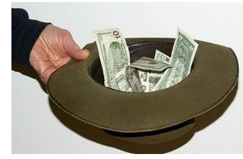
contributed in October!