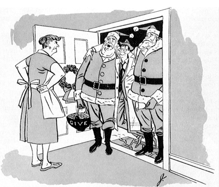
"You the party that wanted her old man home for Christmas?"