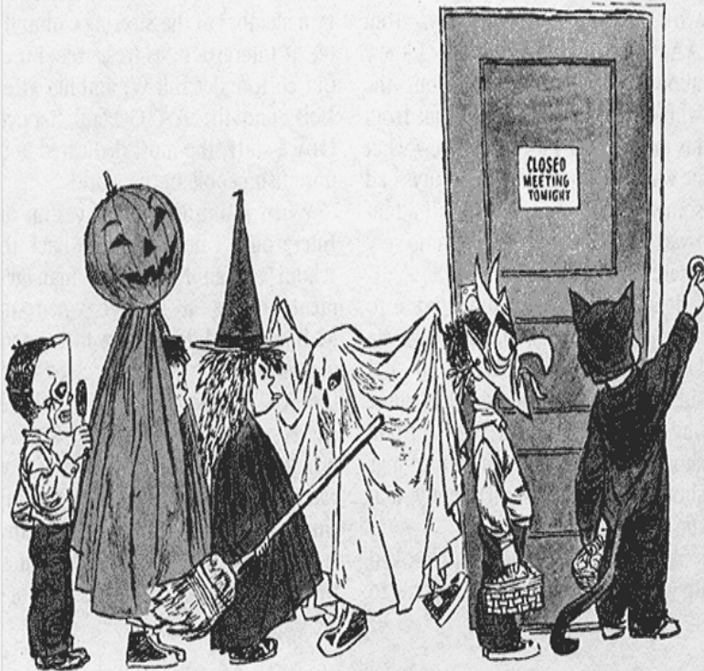
Cartoon reprinted with permission of the A.A. Grapevine, Inc. October, 1982.

Southern Minnesota Area 36 Recovery, Unity and Service Conference January 22 — 24 Fairmount MN, Holiday Inn www.area36.org