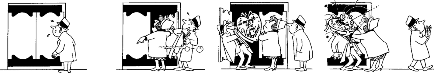
Cartoon reprinted with permission from the A.A. Grapevine, February 1995.