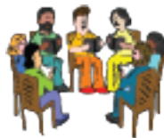
Meeting Info Calls