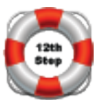
12th Step Calls